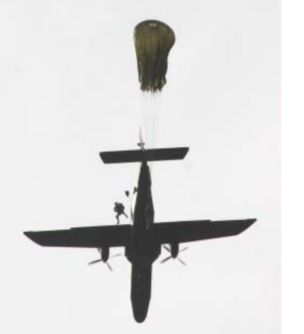
Green light, GO! Brig. Gen. William Garrett, commander of the Southern European Task Force (Airborne), exits the Dornier 228 airplane over Alpe di Siusi drop zone, near Bolzano.

Alpe di Siusi drop zone is set in the panoramic Dolomite mountain range, 2,000 meters above ground level, making it one of the highest drop zones for military parachutists.